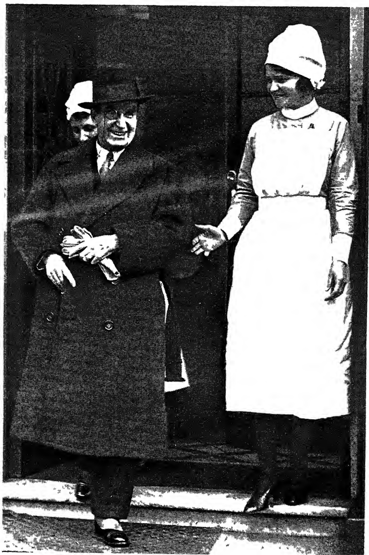
LEAVING THE NURSING HOME AFTER MY OPERATION